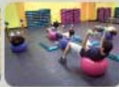
Health Club With Steam Shower