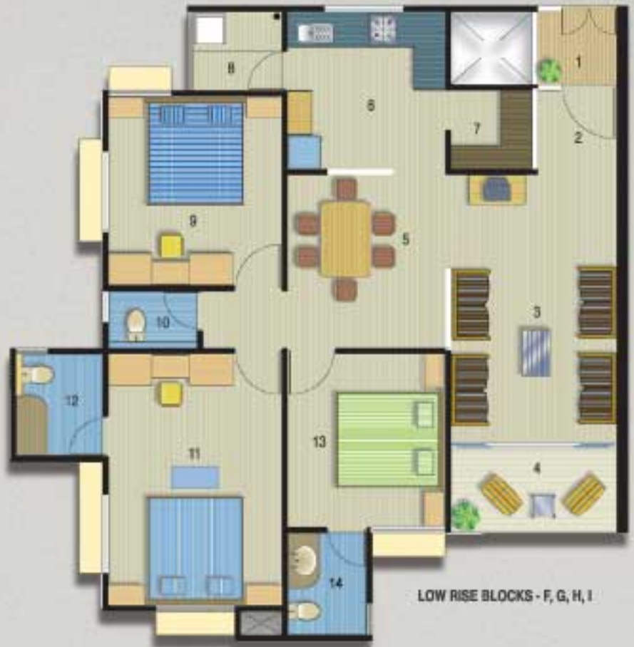
LOW RISE BLOCKS - F, G, H, I