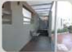
Drop Off Zone