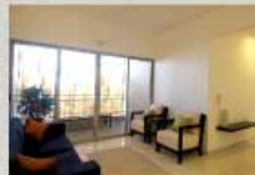
These images are actual photographs of the site and sample flat.