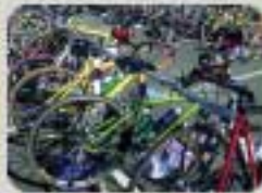
Separate Parking Space For Children